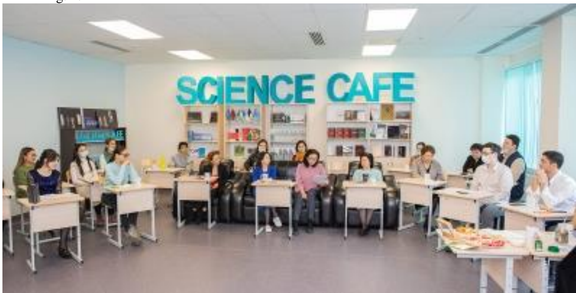
Fig. 2. «Science cafe»

The «Science cafe» format is a pleasant scientific communication, an informal discussion that develops into a single and convenient form of self-study. Science safe was created to develop the skills of scientific collaboration of teachers, students, undergraduates and doctoral students. Science cafes is a training format that represents the direction of informal science education, which is rapidly developing around the world, it turns out that it has more than 250 options.